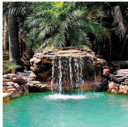
GRP WATER FALLS